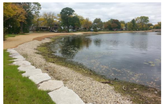
Photo of existing limestone wall at Tenney Park.